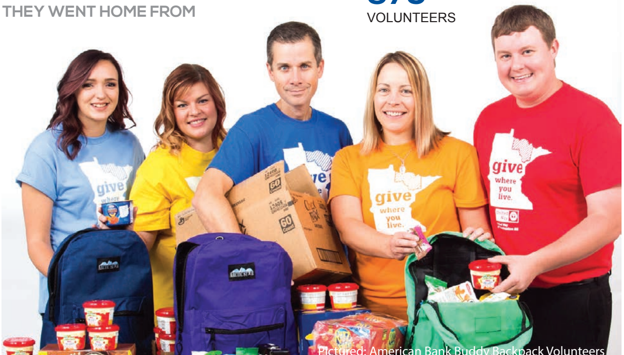
Pictured: American Bank Buddy Backpack Volunteers