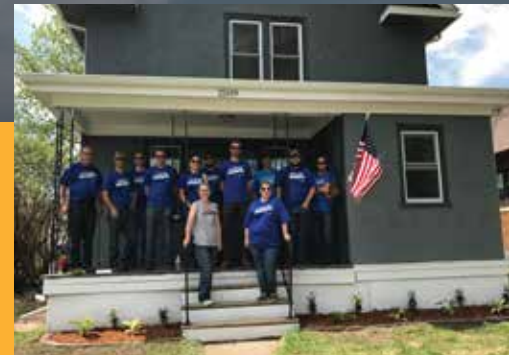
Employees from Minnesota Power and Delta Air Lines volunteered to work on the United for Veterans transitional house in May of 2018.